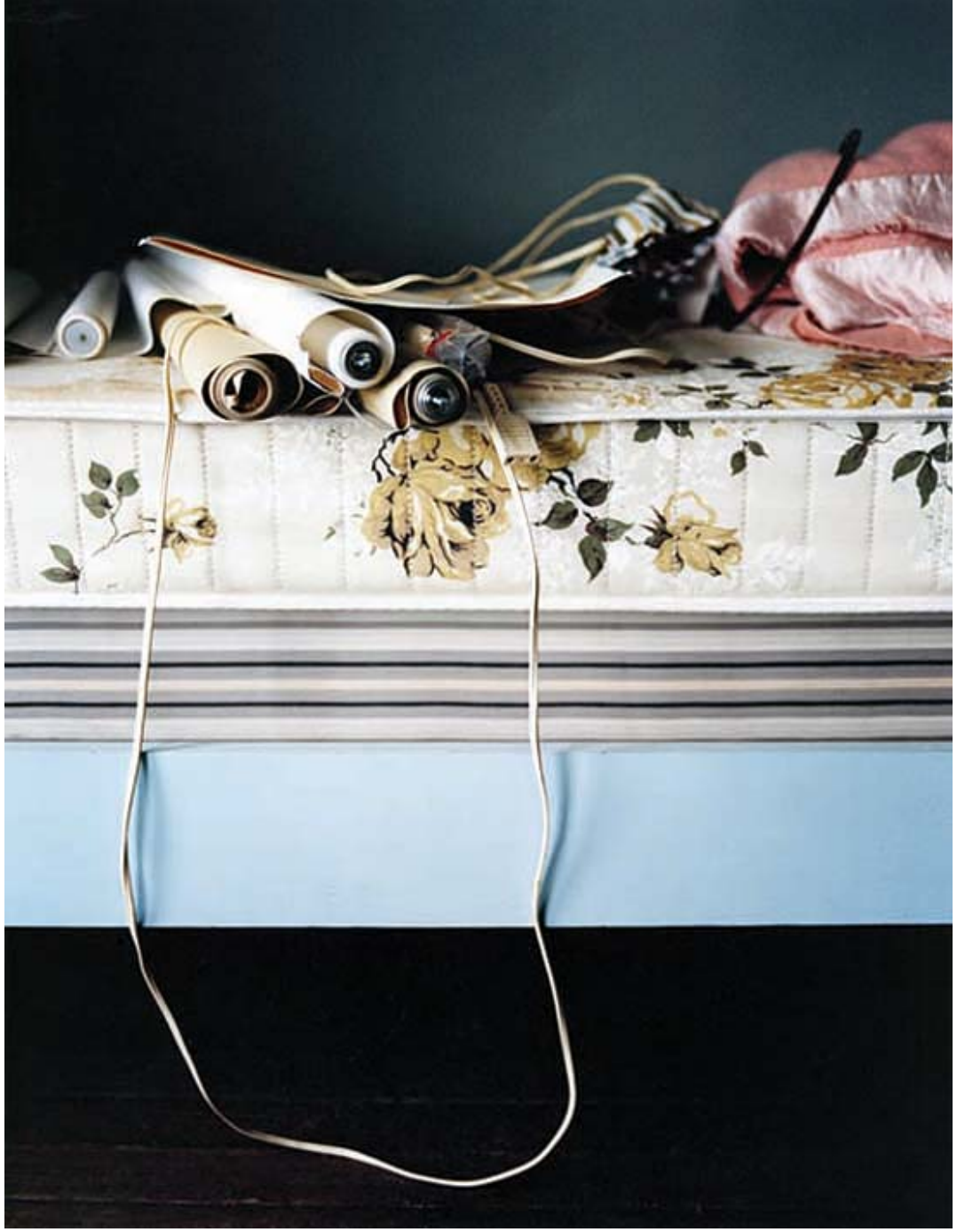
Roses and Cables, 2007