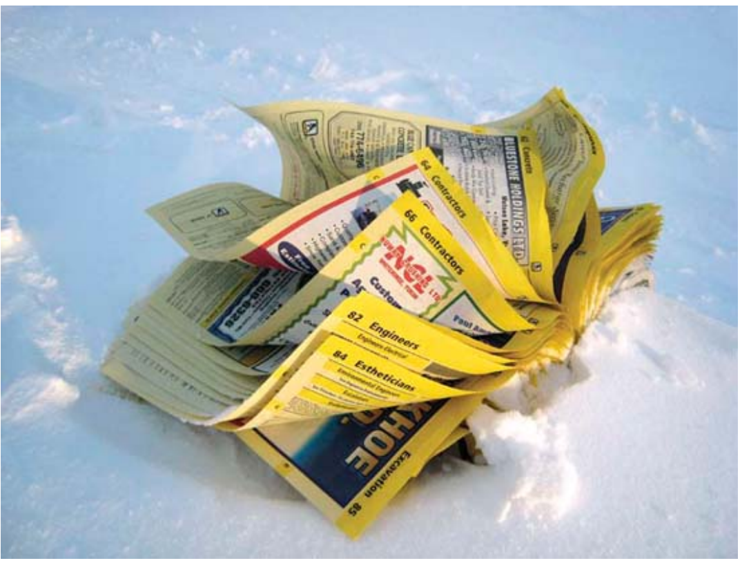
Small Wonder, 2008