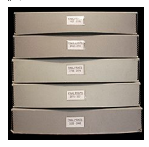
EUGENE ATGET: PHOTOGRAPHE DE PARIS